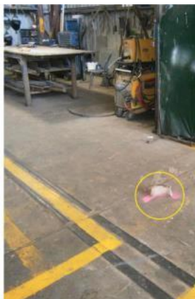
L: Position of spring in storage yard when event occurred, with wall entry point. R: Spring fragment final position on workshop walkway.