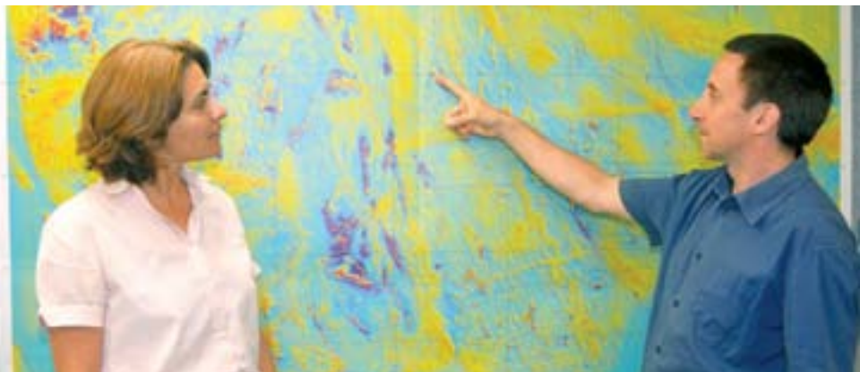
WA's state solid geology map Geoview.