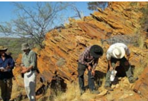
DMP field geologists in Gascoyne Region.

When a company or individual explores for petroleum, they make an agreement with the Government that secures their rights to any resources discovered within their exploration title. In return, they are required to share any geological information with the rest of the community, within five years of the exploration activity.