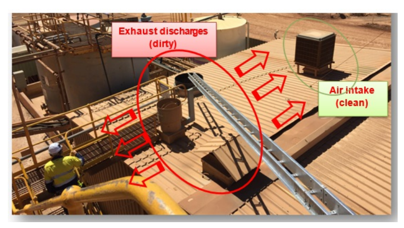
Example of a poorly placed gold room exhaust