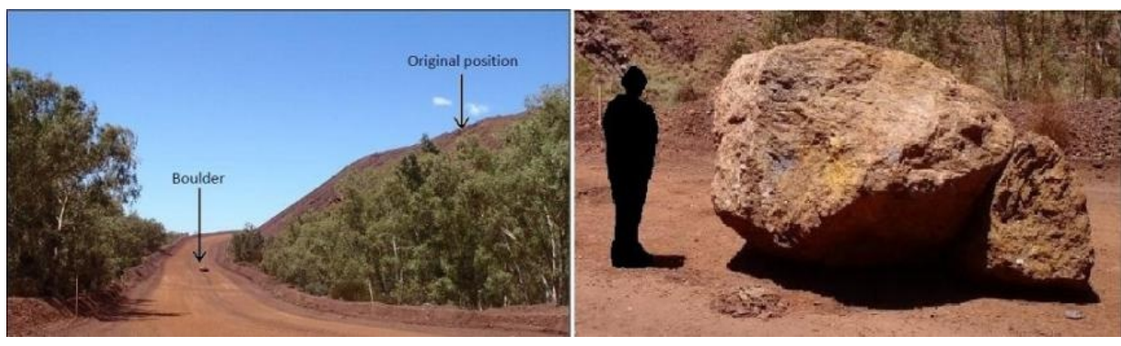
Photographs showing boulder's original and final positions; and size of boulder