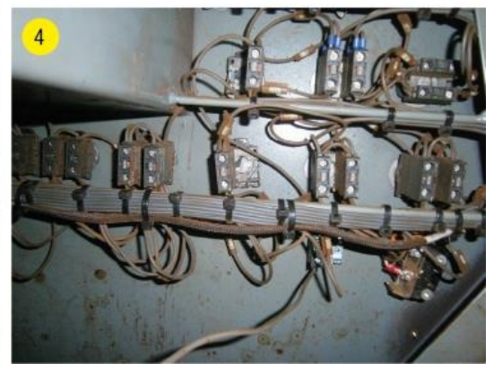
1. Bent head-slide bracket shown with drill head above the deck wrench 2. New head slide did not fit between head bracket and mast 3. Driller's cabin showing seat position and control panel 4. Exposed wires and switches on the underside of the control panel.